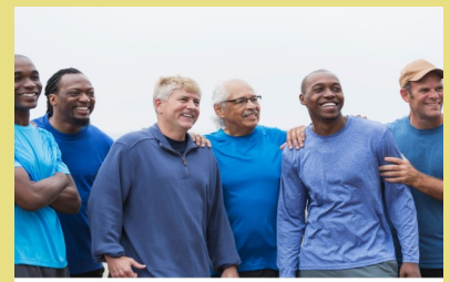
Men of Grace

Growing up in Grace was very memorable to me and I hope to some of you reading this also. Stay safe and enjoy the holidays.